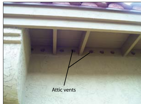
Figure 1. An open overhang. The exposed timber rafters and decking are susceptible to ignition, and embers and hot gases can enter the attic through unprotected vents.

Soffits. A soffit encloses the underside of sloped- or flat-roof overhangs. Soffits are commonly constructed from fiber-cement panels, metal panels, stucco, vinyl panels, or wood sheathing. Metal panels, untreated wood panels, and vinyl